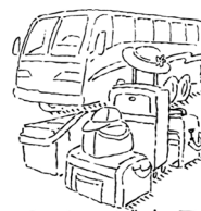
Senior Adult Trip

Now is the time to help purchase Back-to-School items for the shoeboxes. We need: crayons, markers, pencil bags, small note-pads, small calculators, small water bottles, small games and coloring books. A tub is in the sanctuary foyer for your items.